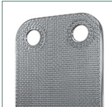
Innovative micro plate design