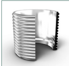
Flexible two-in-one connection