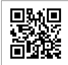
Scan QR code for more technical information and code numbers