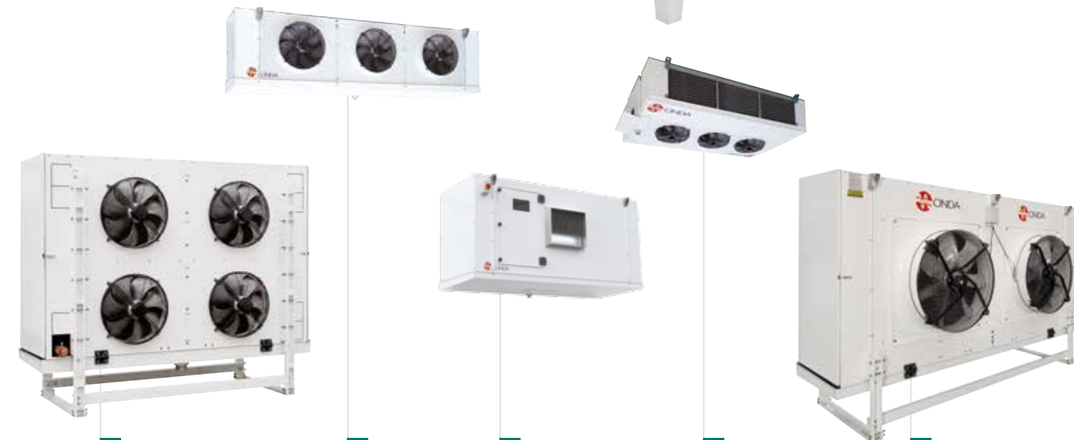
ET Blast Freezer