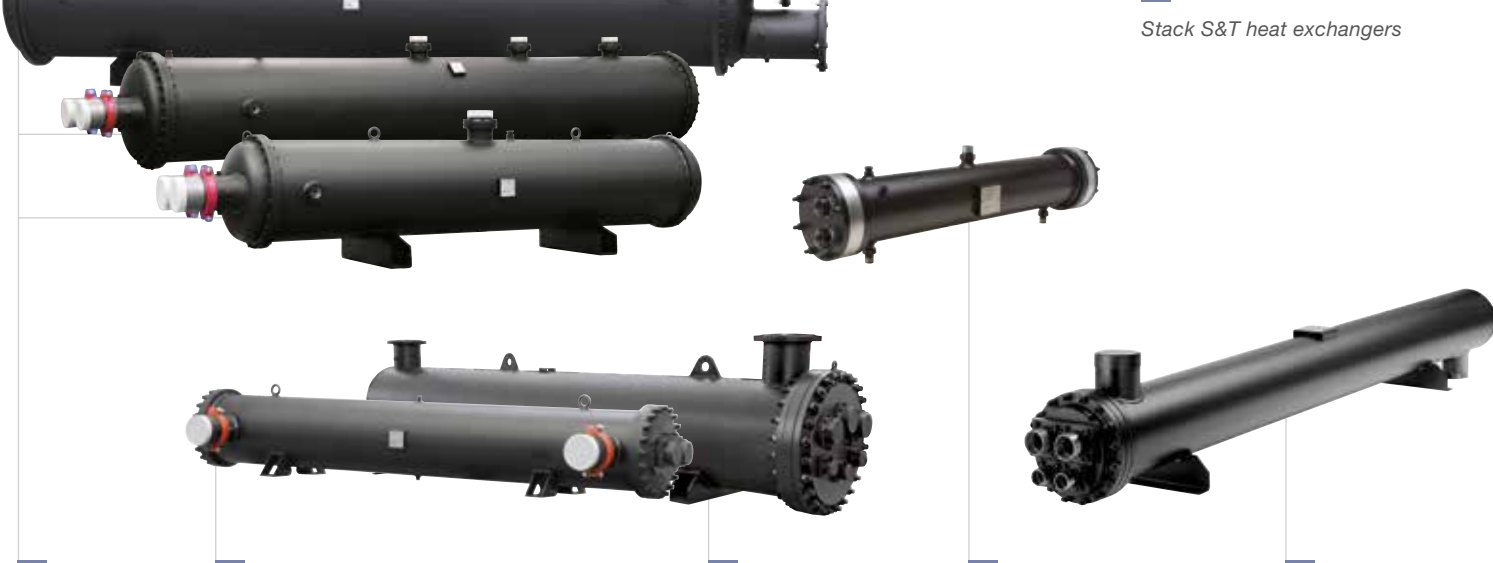
FLT - FLS Flooded evaporator