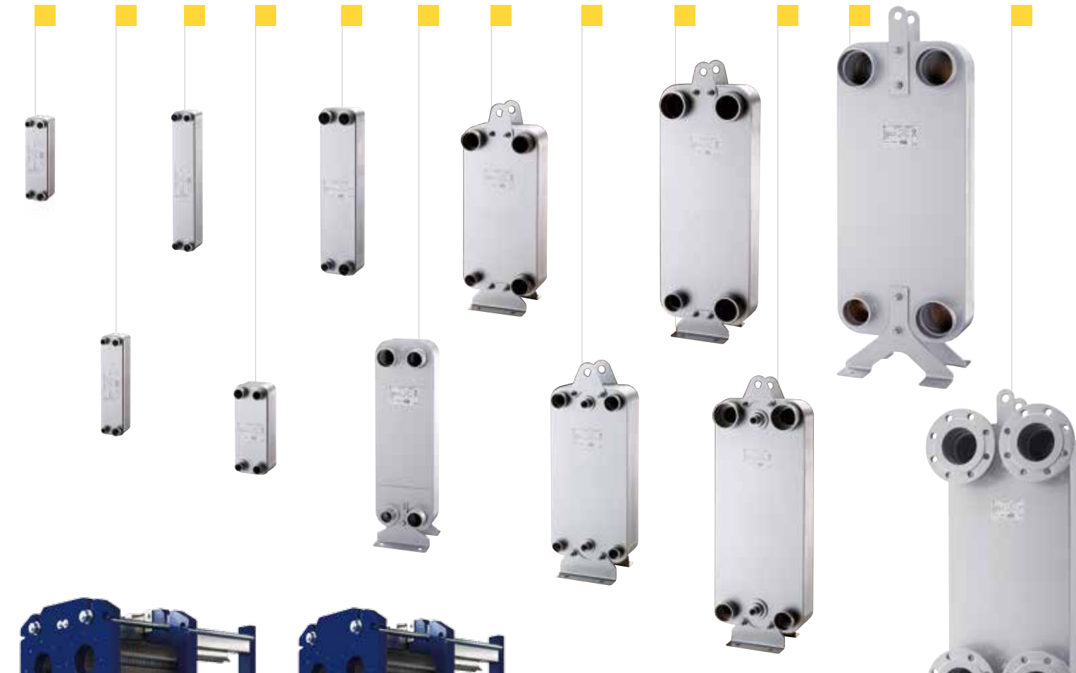
E - A Industrial air and unit coolers